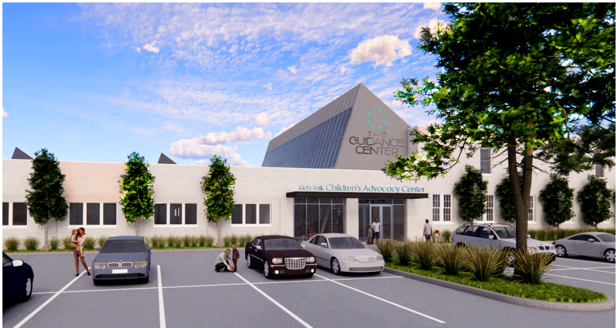
Proposed renderings from THOMAS ROBERTS Architect (not final versions)

To bring our impactful vision to life, we are embarking on a $15 million capital campaign to raise the funds necessary for this critical undertaking. Achieving this bold goal will require support from several key areas. Therefore, the campaign will include a blend of private philanthropic support, public funding, and the proceeds from the sale of our current location.