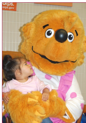
Each year The Guidance Center's Community Resource Centers host literacy events and family fun fairs for thousands of local children and their families.